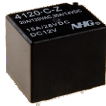
Wash tight 26.8×21.5×22.3